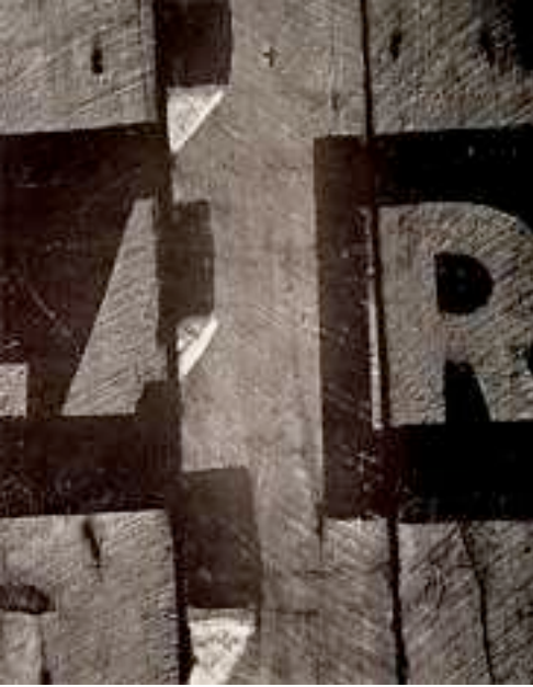
Aaron Siskind - Kentucky 4, c. 1949-51

The close analysis of objects can reveal unexpected characteristics and bring about new understandings. Consider relevant images by photographers such as Aaron Siskind, Karl Blossfeldt and Edward Weston.