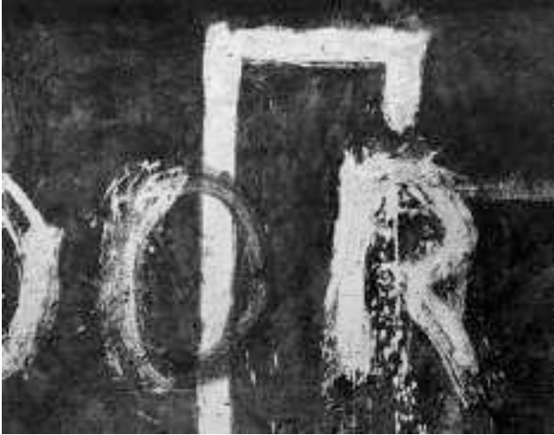
Aaron Siskind - Urapan 3, 1955

Karl Blossfeldt - Plate # 38: Polystichum munitum (magnified 6 times) Photogravure, printed in 1928. Click here to see the entire collection of images which formed Blossfeldt's groundbreaking 1928 book Urformen der Kunst (Art Forms in Nature) .