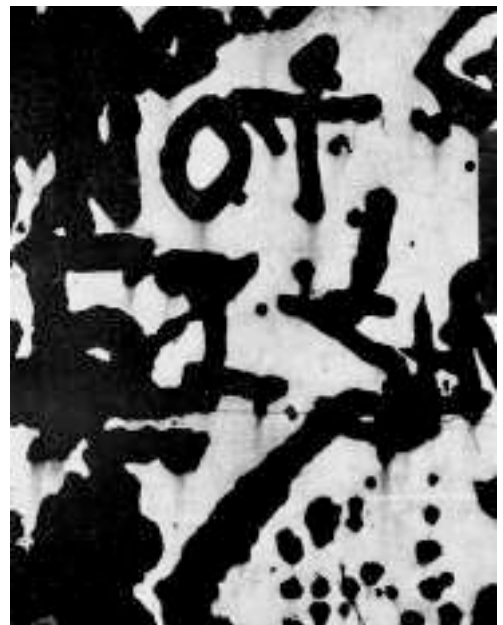
Aaron Siskind - New York, 1951

Click here to see more of Siskind's work at The Museum of Contemporary Photography.