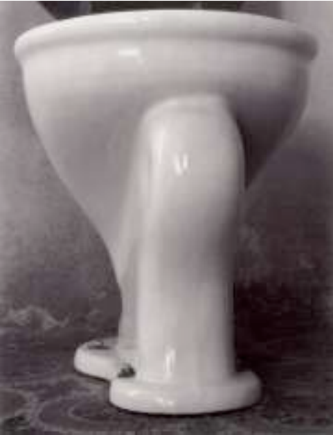
Edward Weston - Excusado, 1925

"Photographers take note! With a medium capable of revealing more than the eye sees, 'things in themselves' could be recorded, clearly, powerfully..."