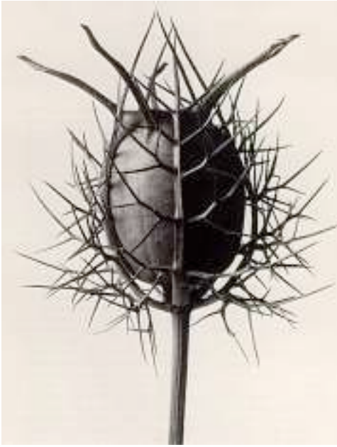
Karl Blossfeldt - Nigella Damascena