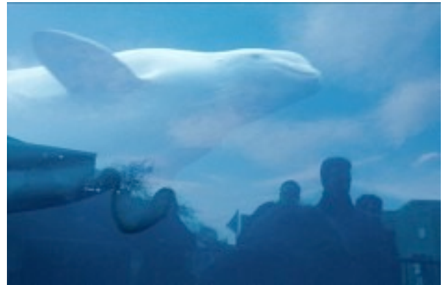
Rebecca Norris Webb - from The Glass Between Us