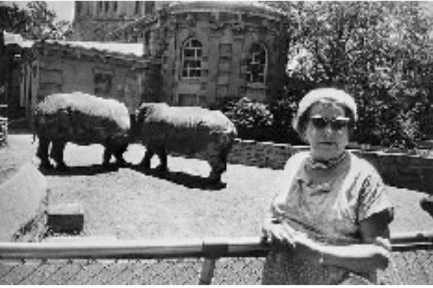
Garry Winogrand - from The Animals, Brooklyn Zoo, 1960s