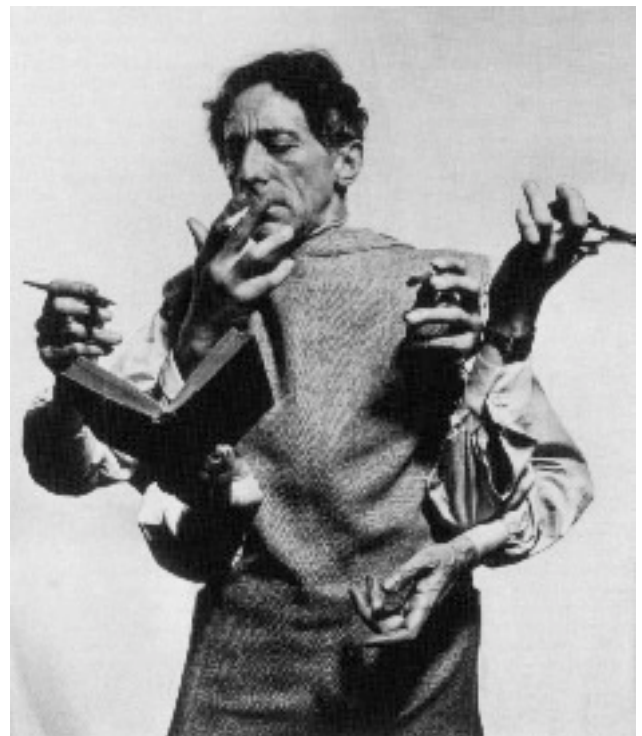
Philippe Halsman - Portrait of Jean Cocteau