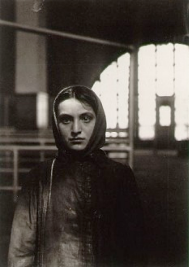
Lewis Hine - Young Russian Jewess, Ellis Island, New York, 1905

Facial expression and body language, observed in people and animals, have been recorded by photographers and film makers using a variety of techniques and approaches.