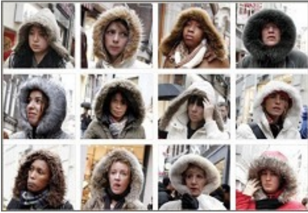
Hans Eijkelboom - from the series Photonotes , 2004