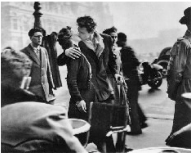
Robert Doisneau - Kiss by the Hotel de Ville, 1950