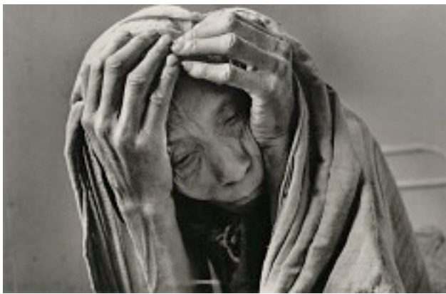
Sebastião Salgado - Gourma-Rharous, Mali, 1985