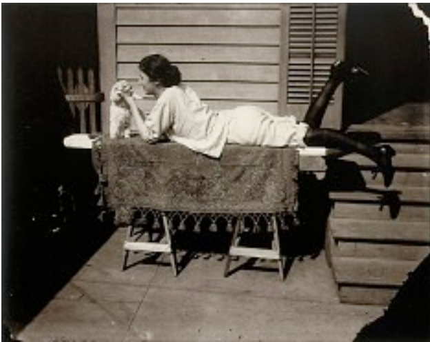
E. J. Bellocq - Untitled, c. 1912