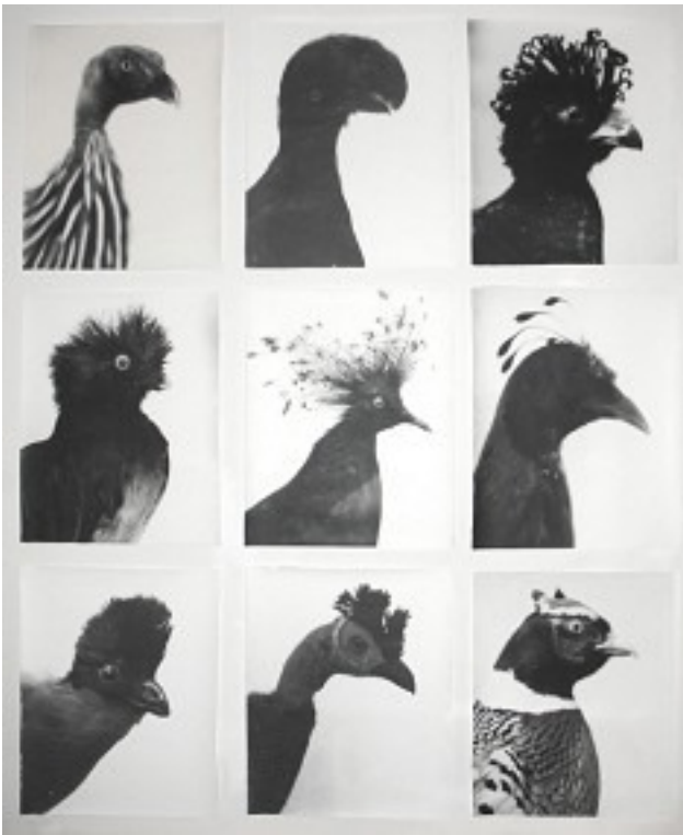
Jochen Lempert - Oiseaux - Vogel, 1997